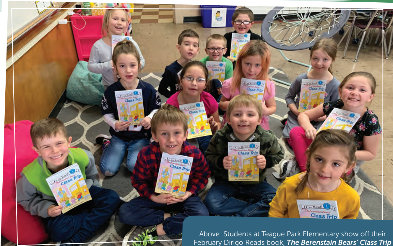
Above: Students at Teague Park Elementary show off their February Dirigo Reads book, The Berenstain Bears' Class Trip

"What a great program! Students look forward to the monthly gift of books! They were caught reading them regularly!"